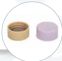
28LS 28mm with 410 longer neck