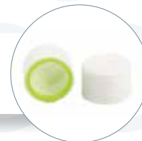
28 PP TE CR 28mm