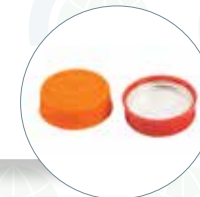
44 STL CR 44mm