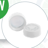
38/400 Jumped CR with non-Talc inner