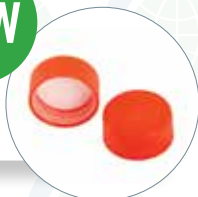
33/400 Jumped CR with non-Talc inner